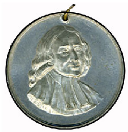
Children's Wesley Medal