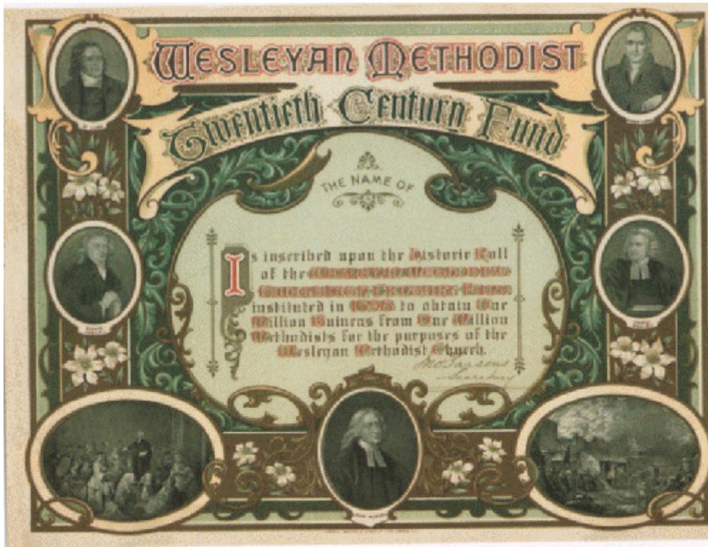
Adult Donor's Certificate